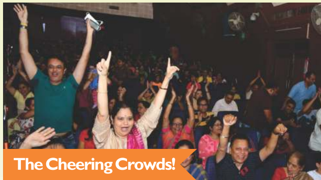
The Cheering Crowds!