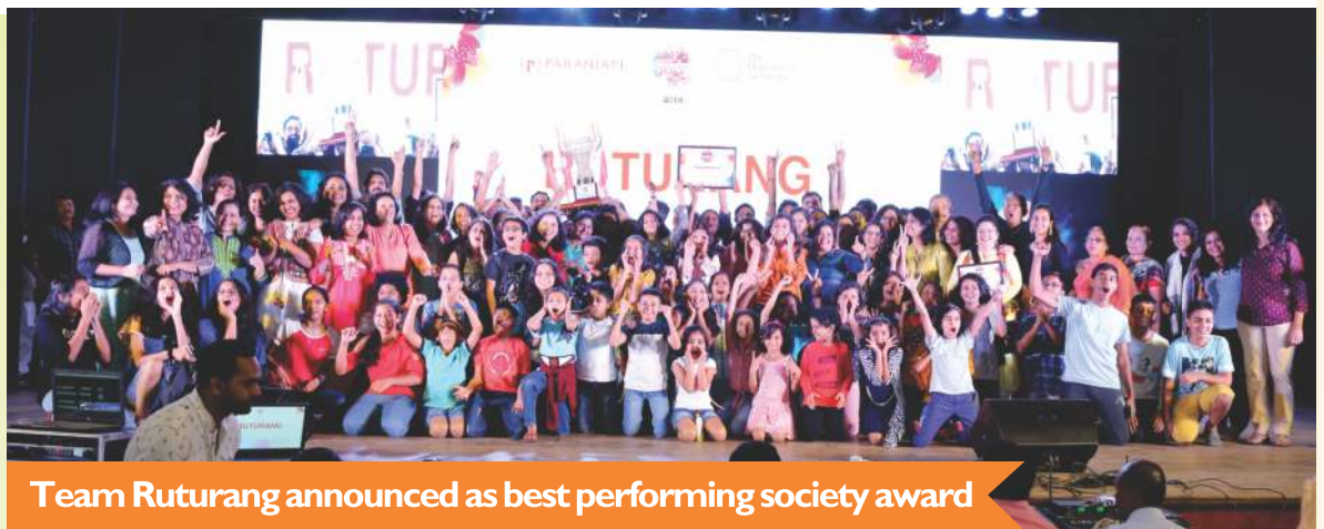
Team Ruturang announced as best performing society award