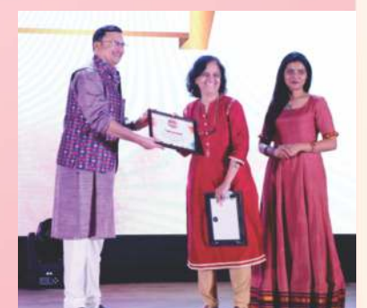
Best Set - Athashri Baner B