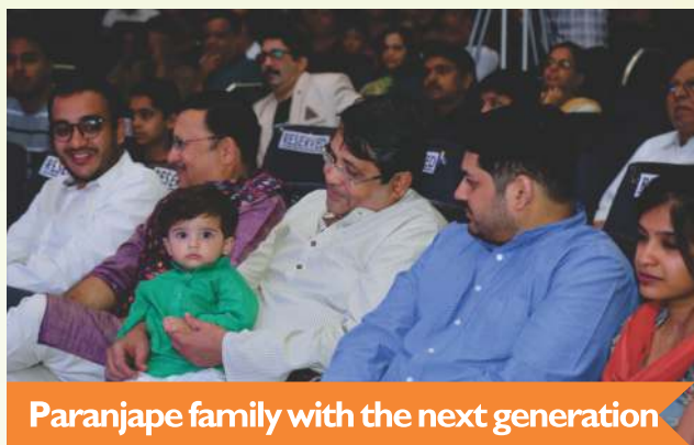
Paranjape family with the next generation