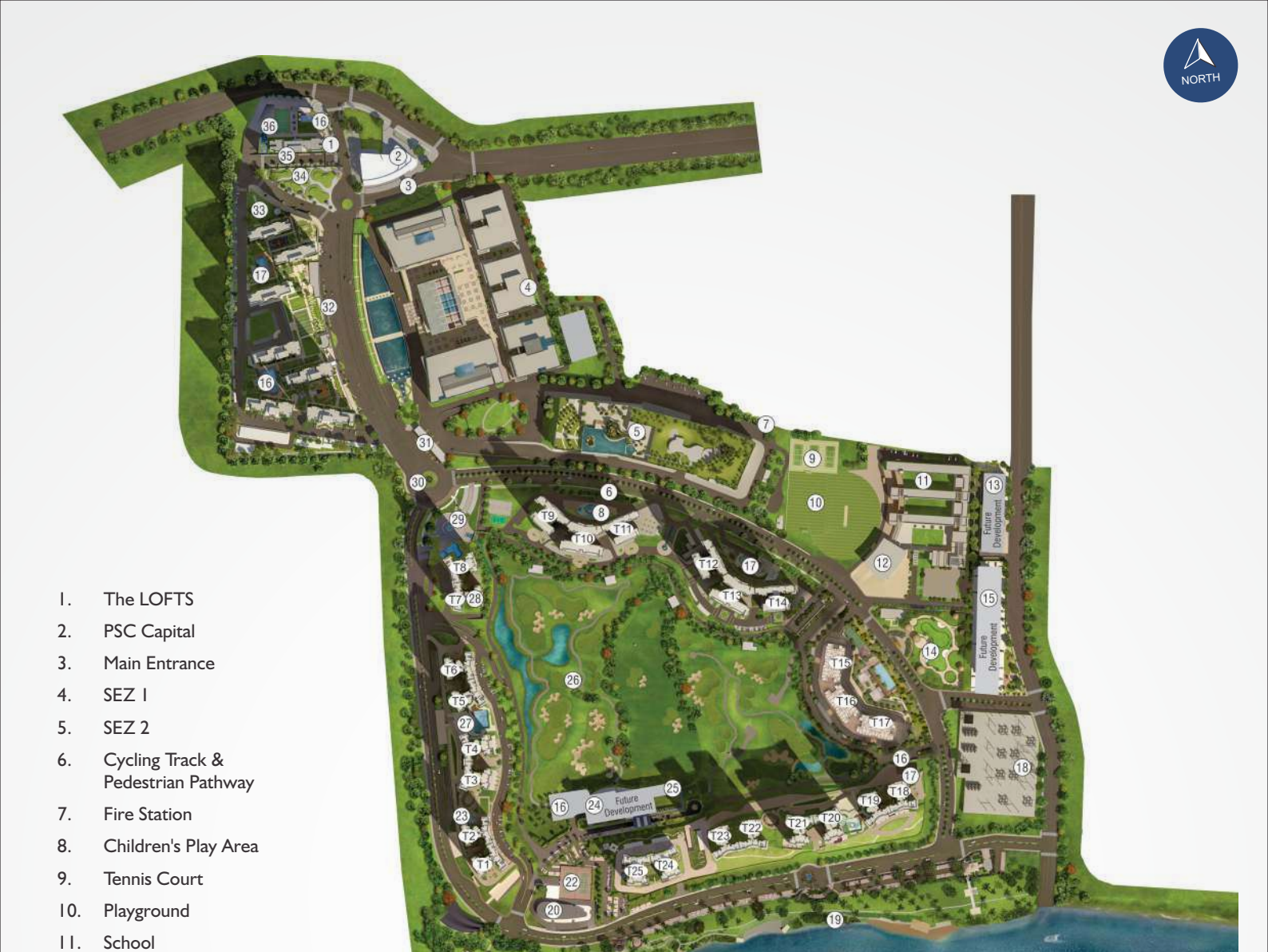
Note: This is a schematic master plan. While all amenities will be provided, the location and detailing is subject to change. This is only to be used for foam board design.