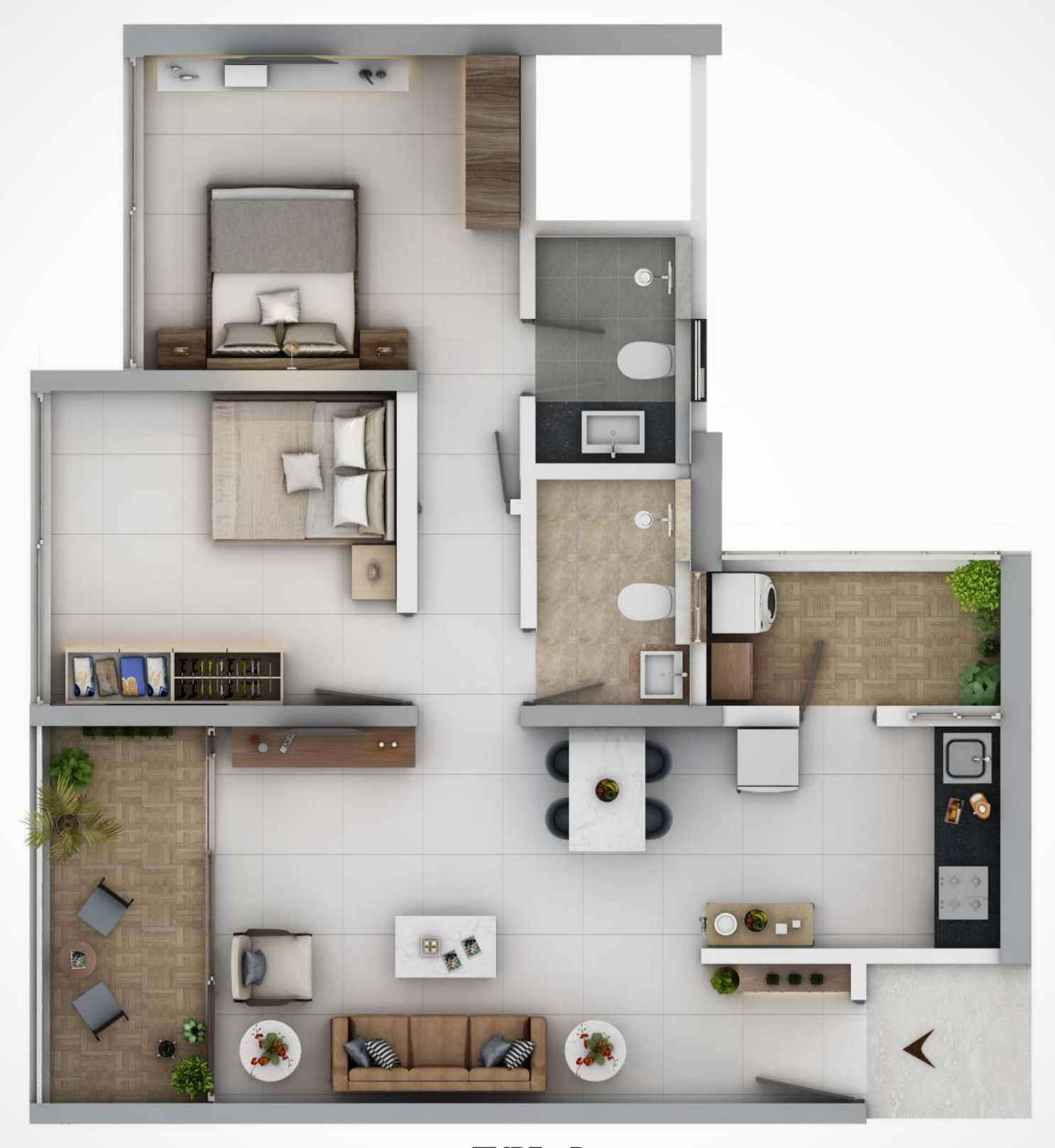
TYPE - B