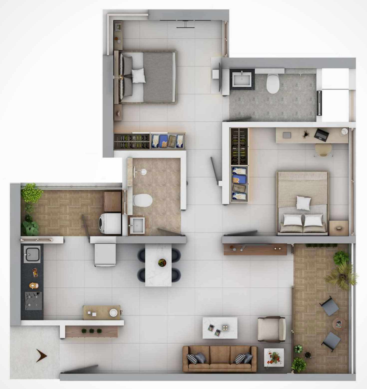
TYPE - A