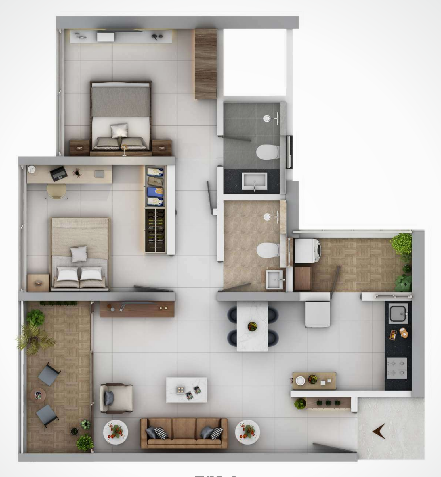
TYPE - B