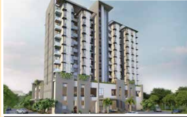
Athashri Hinjewadi, Pune