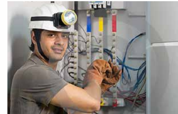
Maintenance - Electrician