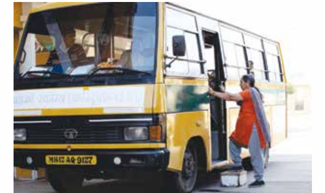
Shuttle bus service