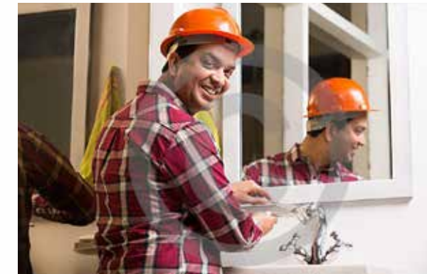
Maintenance - Plumber