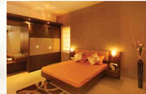
Well furnished guest rooms