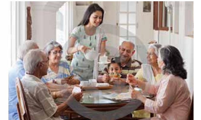
Space & facility for guests