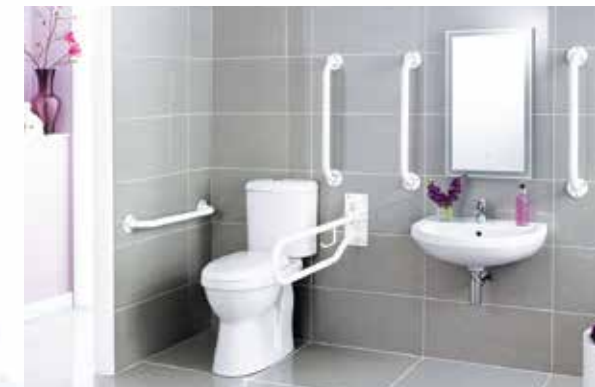
Grab bars in washrooms