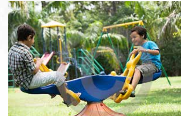
Kids play area