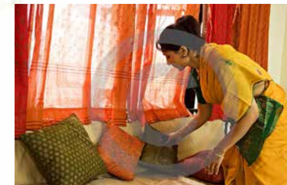
Well-trained maid servant