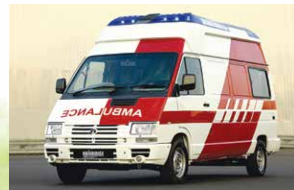
24x7 ambulance facility