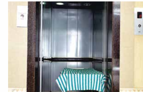
Generator backed lifts