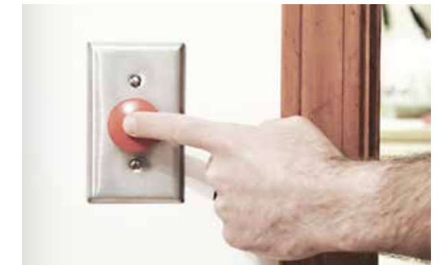
Panic switch alarm