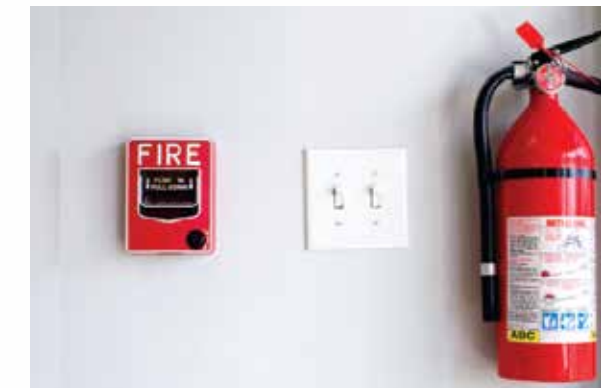
Well-equipped fire security systems