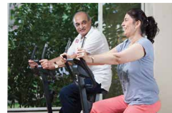
Specially designed gym