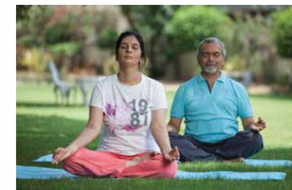
Yoga & meditation area