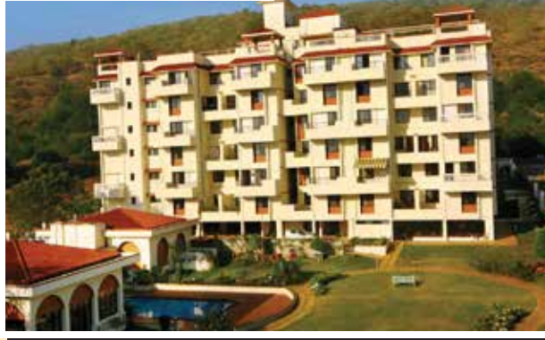
Athashri Pashan, Pune